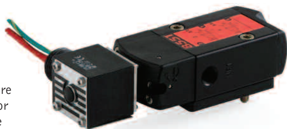
NAMUR mount valve

Pilot valves also are available in many mounting configurations. The most common are piped, NAMUR-mounted, pilot valve islands, and pilot valves