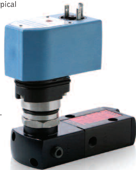
Piezo-operated pilot valve for use as a Foundation fieldbus or Profibus PA output device

Depending on the environment, many methods of protection are used. A large part of the process control market requires explosion-proof equipment. To meet that requirement, the pilot can be designed using intrinsic safety in such a manner that the solenoid cannot cause a spark or generate sufficient heat to create an ignition source. Another protection method is to contain possible sparks or explosions within an enclosure that will not allow flame to propagate to the outside atmosphere. These products either have the explosion-proof enclosure or use electronics that are encapsulated with some type of potting compound. Third-party approval for these protections can be achieved, depending on where the customer is located.