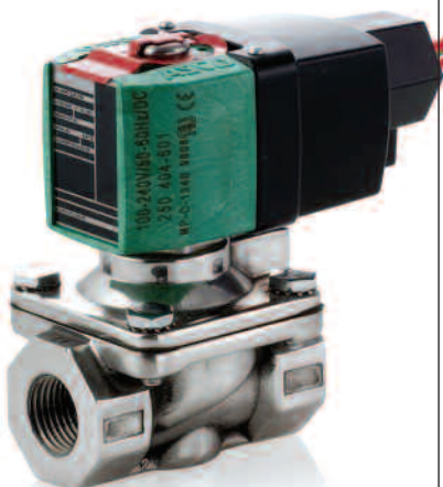
Valve with a voltage ranging coil

To meet specific customer needs, pilot valves are available in a multitude of variations. Electrically, they vary by voltage, power consumption, and method of protection. Most solenoids can be designed for use in almost any voltage, whether it's AC or DC. The trend in the market is toward DC because of increased use of distributed control systems and bus protocols. The only drawback in using DC is that most solenoid valves in DC valves cannot operate at the same pressure as their AC equivalents. However, some manufacturers now have technology that permits the same pressure rating whether the valve is AC or DC. In fact, solenoid coil technology has improved so much that a customer can purchase one valve and operate it over a given voltage range such as 100 to 240 at 50 to 60Hz in AC or DC.