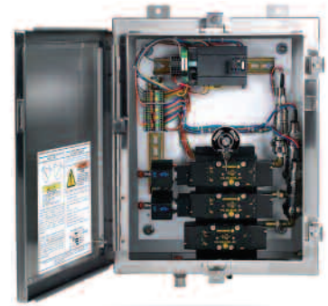
Redundant solenoid system for reliability and safety

cient to shift the valve is connected to the external pilot connection, while the main valve body controls the flow of low pressure air into the control valve.