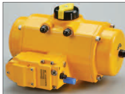
Actuator with built-in position indicator and solenoid valve

Generally, customers prefer one valve construction over another. Many like the poppet-style valve because movement is in direct relationship to the movement of the solenoid armature. These direct-acting pilot valves do not require minimum air pressure to operate. For this reason, this style of valve is used to operate dome-actuated control valves that operate between 0-15 psi. Spool valves are considered indirect-acting valves, since they require a minimum amount of air pressure to cause the spool to move. Actually, most spool-type pilot valves are operated by a small, three-way, direct-acting valve that transfers air pressure to a piston, which then pushes the spool and causes movement. Indirect-acting valves can be used on control valve applications as well, but the valve must have an external pilot connection. Air pressure suffi-